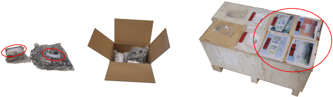
3 2 different items, with their corresponding stickers, in 1 box