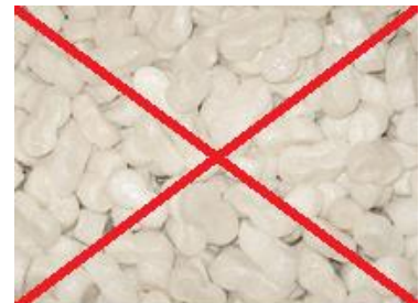
7 Foam chips