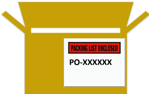
5 Packing list + Huisman PO