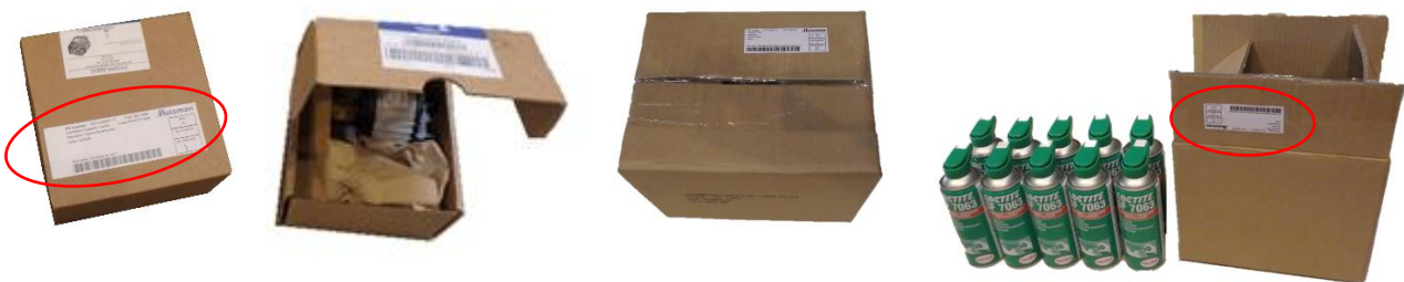
1 1 item, in 1 box, with a sticker