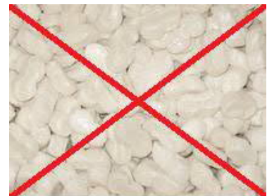
7 Foam chips