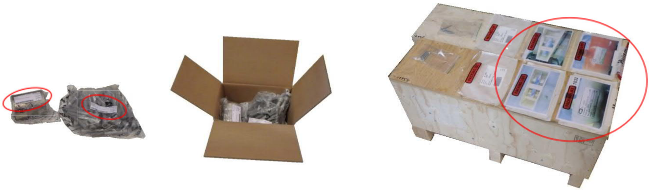
3 2 different items, with their corresponding stickers, in 1 box