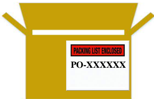
5 Packing list + Huisman PO